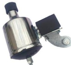
Fig 2. Dynamo Generator

Dynamo is equipment which converts the kinetic energy into electrical energy generally the dynamos are small permanent magnet alternators. Dynamo starts continuous rotation with planetary gear Experimental setup Fix with one stand with two wheeler body. Chain sprocket running condition experimental setup fixed to produce rotational energy is converted into electrical energy. The generated power is stored to the battery. It can be stored in the battery after rectification. The rectified voltage can be inverted and can be used in various forms of utilities. The battery power can be consumed for the users comfort.