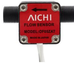
Fig3. Flow Sensor

Ambient operating temperature: -10 to 70 degree Celsius